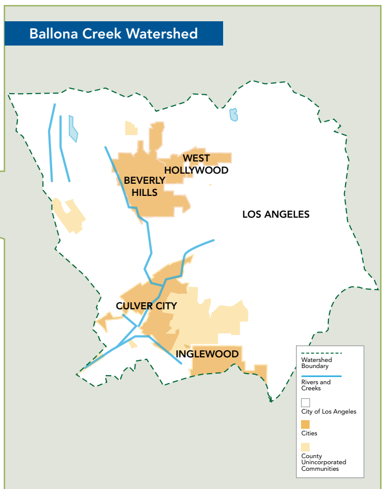
You own property in the Ballona Creek Watershed, which drains to the Ballona Creek and includes all the cities and unincorporated communities shown on this map.