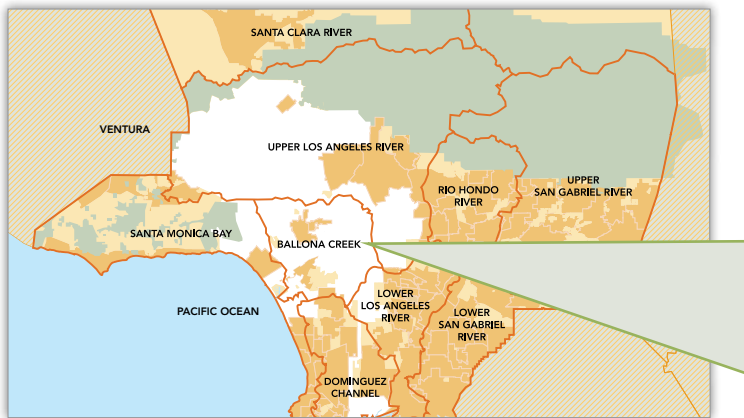
There are nine watersheds in the Los Angeles County Flood Control District in which the proposed clean water fee would be collected annually.

Stormwater and urban runoff flush bacteria, trash and other pollutants into gutters in streets and into storm drains and from there into lakes, rivers and the ocean and onto beaches. Waterways throughout Los Angeles County have been found to be polluted above acceptable levels under the federal Clean Water Act and other state and federal laws.